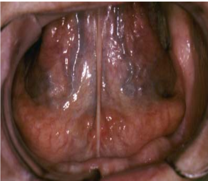
Figure 2. No pooling of saliva on the floor of the mouth