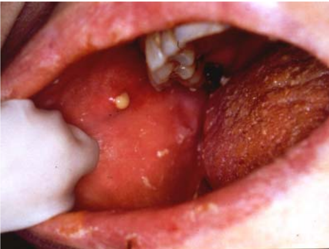
Figure 6. Primary Sjögren's syndrome: infected parotid gland –pus from duct