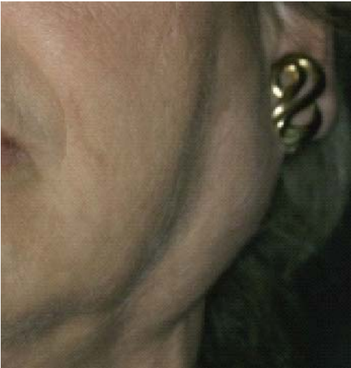
Figure 5. Primary Sjögren's syndrome: parotid gland swelling