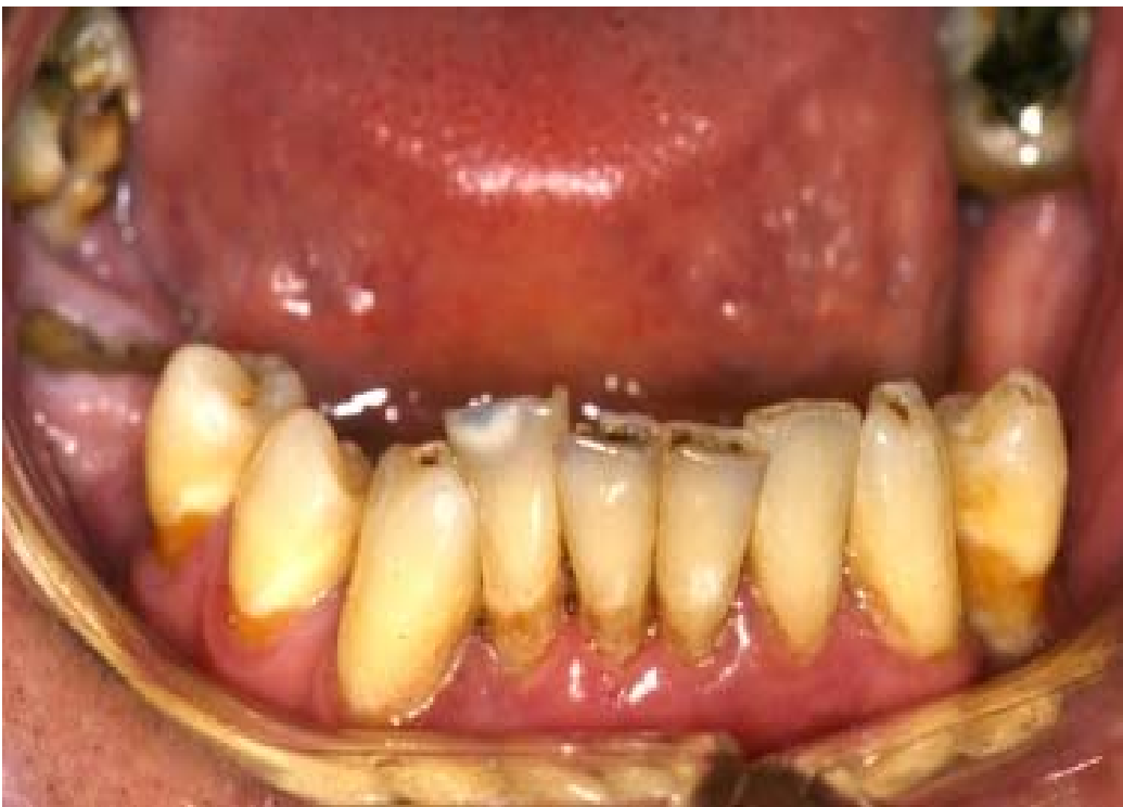
Figure 4. Primary Sjögren's syndrome: dental decay